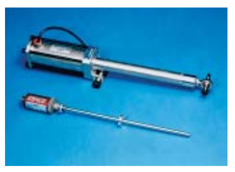
Series 951 LDT, 952 BlueOx<sup>TM</sup> LDT (not pictured) and 950 MD Mill-Duty Housings