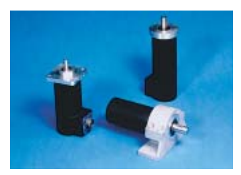
Series 1986 Standard Resolver Packages Gemco is a trademark of Ametek.